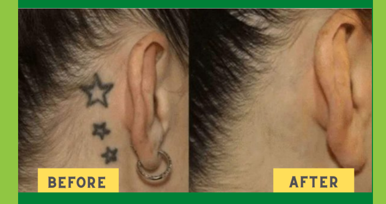
Mole & Warts Removal